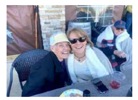
REFORMATION SUNDAY AND HARVEST FEST - OCTOBER 29