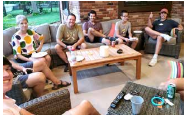
YOUTH SPLASH INTO THE NEW YEAR SWIM PARTY - AUGUST 20