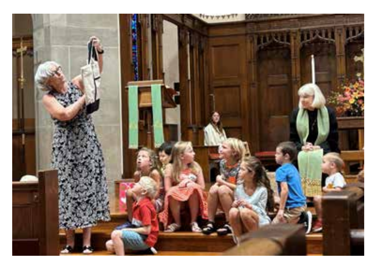
SPLASH INTO THE NEW YEAR YOUNG FAMILIES SWIM PARTY - SUNDAY, AUGUST 27