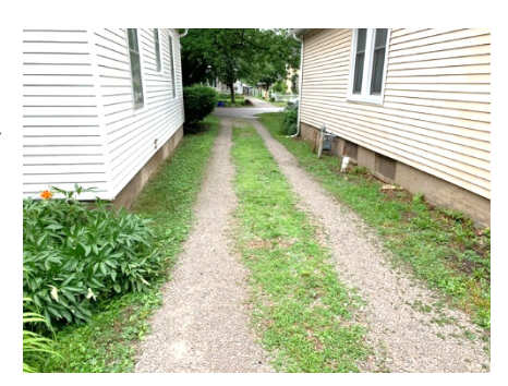
Grant to pave shared driveway of 506 and 508. S. Glenwood was awarded.