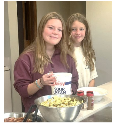
Youth raise $2,814 at the annual Spud Bake.