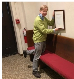
PHOTO GALLERY OF WESTMINSTER'S INSTALLED PASTORS