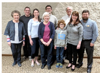
2019 Winning Trivia Team