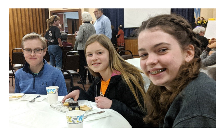
CONTACT MINISTRIES PROM – FEBRUARY 7