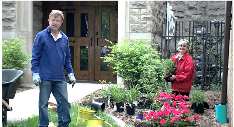
NEW ROOF ON VERIZON GARAGE