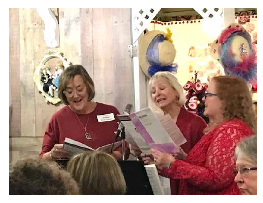
Over 35 women gathered at the English Tea Room for a luncheon hosted by the Elizabeth Circle. After partaking in an array of tea sandwiches and cookies, the Saint Andrew's Sisters sang a variety of carols and songs for the season.