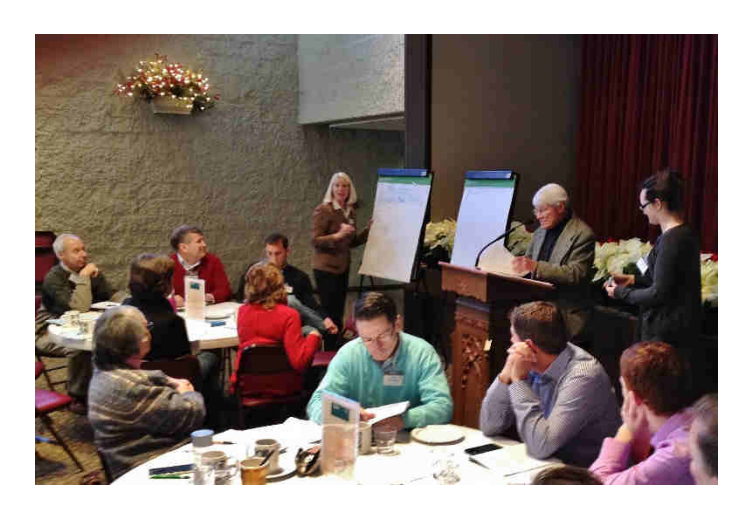
We also spent time within committees to review Westminster's Working Manuel, reflecting on milestones in 2016 and looking ahead to mile markers in 2017.