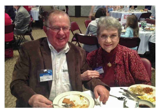
Thanks to the hard work of all involved and the generous support of the congregation, we raised $1453!