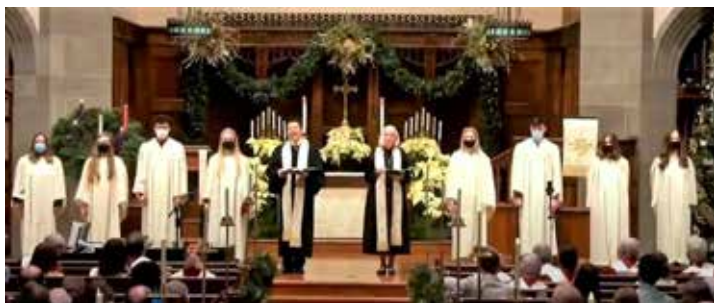
Junior and Seniors participating in the 2021 Lessons & Carols.

High school seniors gather in the East Narthex to robe and prepare to lead the Annual Service of Lessons and Carols. Bring your bells to ring for the final hymn!