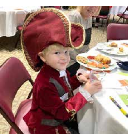
WPC Hosts Children of Abraham on Wednesday, November 10