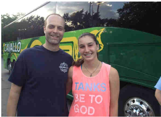
Fearless leaders, incredible duo, organizational gurus!