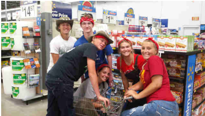
Power shopping at Walmart...