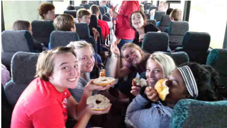
Breakfast on the bus!