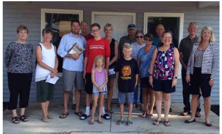
Westminster was well represented at this celebratory event. WPC is one of 12 congregations who raised over $50,000. Along with the home in Springfield, two homes in Bangladesh will be built because of this collaboration.