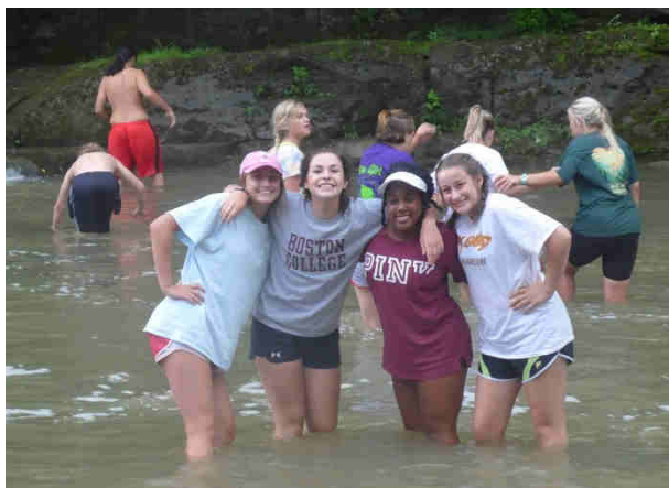
Wade in the water, wade in the water, children!