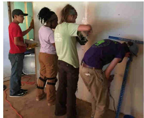
Marking the integrity of the wall with the plum line.