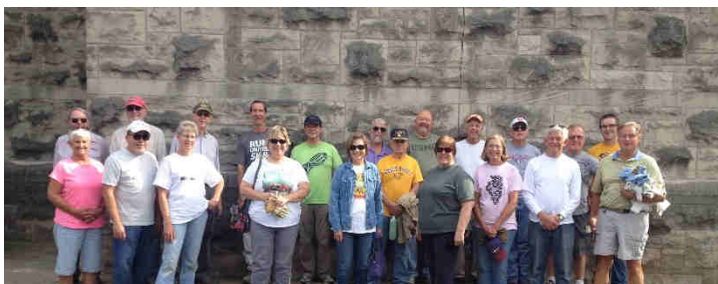
Day Laborers standing in front of wall before the harvest.