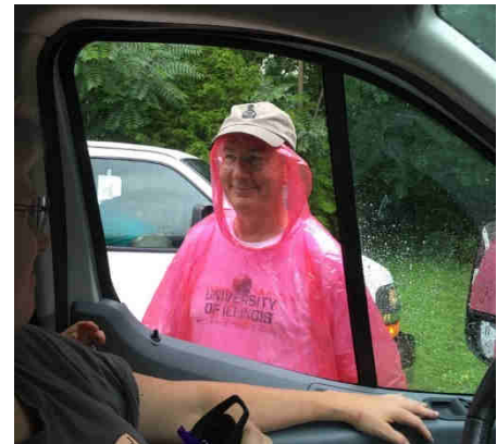
Rain, rain, go away!