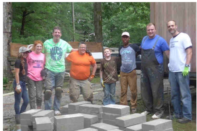
Strengthening God's foundation...one cornerstone at a time.