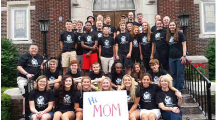
Youth greet and reassure their moms through mission trip blog.