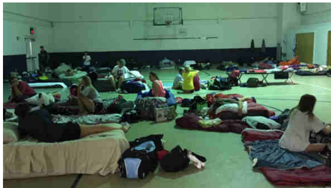
Rise and Shine and give God the glory!