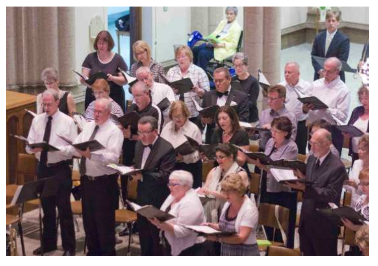
AT THE CATHEDRAL OF THE IMMACULATE CONCEPTION LAWRENCE AND SIXTH STREET