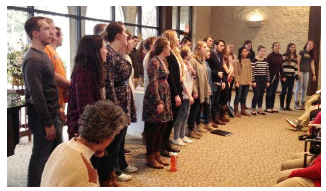
Hope College Chapel Choir sang for Compass and shared a meal.