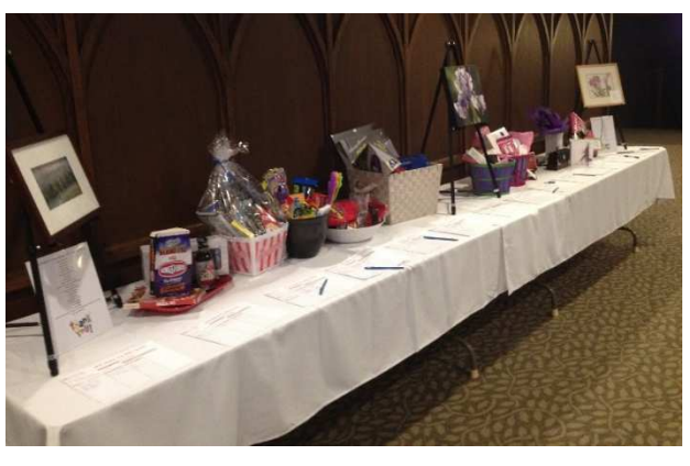
The Silent Auction, a brand new addition to Trivia Night, raised $1,650!

Thank you again to all who made this successful fundraiser possible. Your support helps the youth travel to Appalachian North Carolina for a week of mission and service July 23-30, 2016!