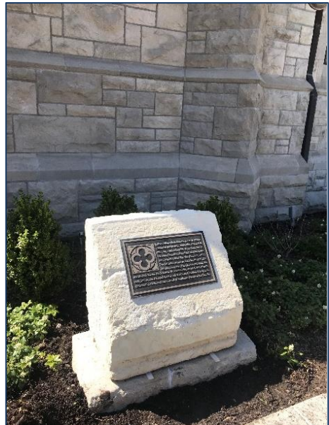
Dedicated on Founders’ Sunday May 22, 2022

The arrow points to the stone pictured on the right.