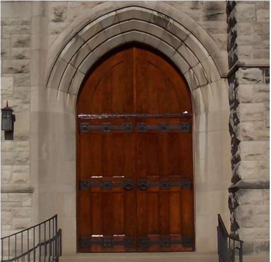
Westminster Presbyterian Church Springfield, Illinois